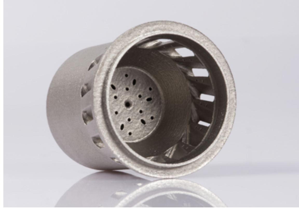
Free choice of fuel: thanks to its complex channels, the burner produces a fuel /