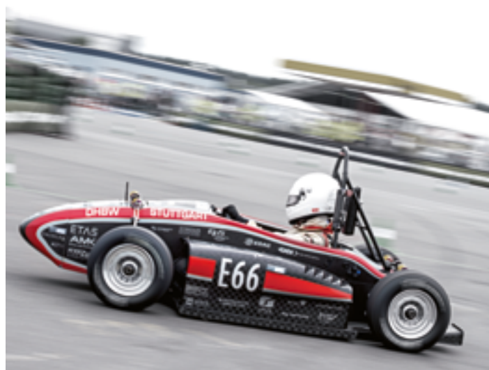
Fast and reliable: The race car with additively manufactured airflow in the battery housing achieved top rankings in the Formula Student events in Germany and Spain.

Construction of the entire battery system was carried out in a way that ensured both mechanical and electrical protection, while optimising cooling. Three continuous channels guarantee air