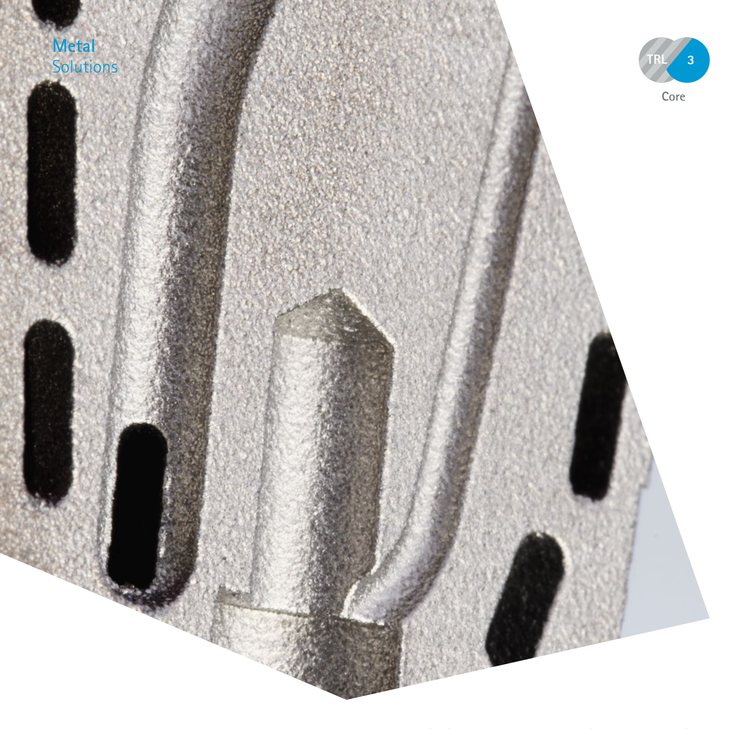
EOS MaragingSteel MS1 for EOS M 300-4